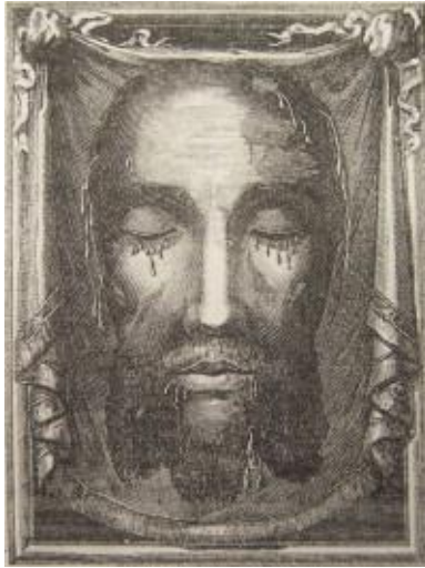
THE HOLY FACE OF JESUS