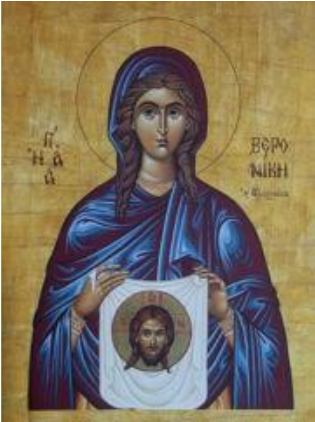
Icon of Saint Veronica (Greek Orthodox) who tradition indicates wiped the Holy Face of Jesus on the Way of the Cross